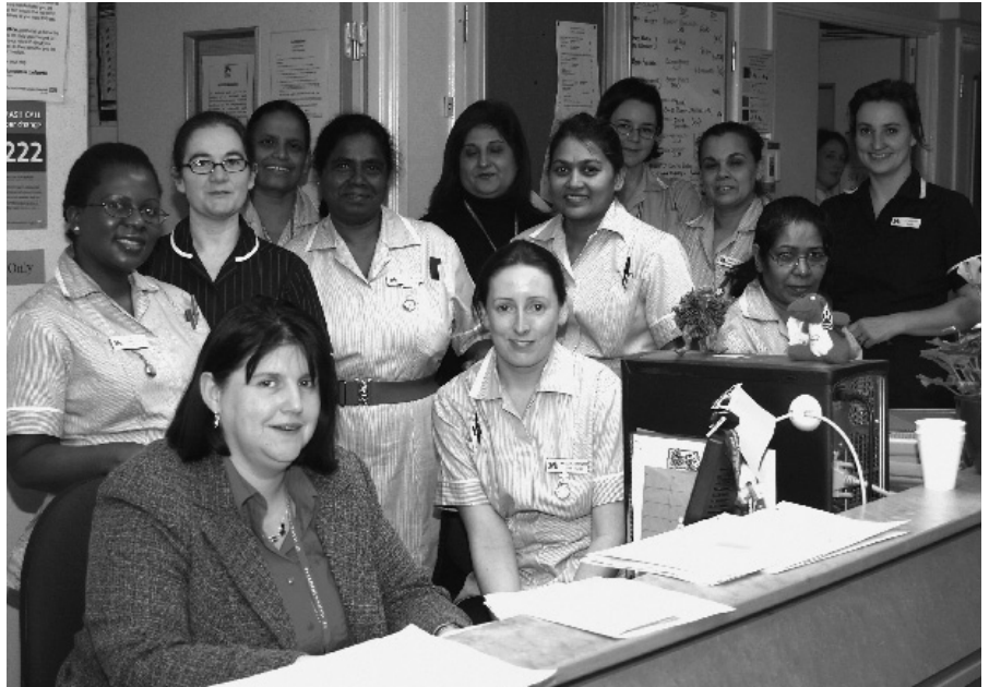
Some of the team on Frederick Salmon Ward.

Firstly I would like to say a big thank you to all of the staff on Frederick Salmon Ward for their dedication and hard work. It has, at times, been a stressful area to work in. As always the ward continues to evolve and patients who attend continue to have the best care possible. Some of the staff have been here for a considerable amount of time and it is with great pleasure that promotions of staff to sister and charge nurse continue.