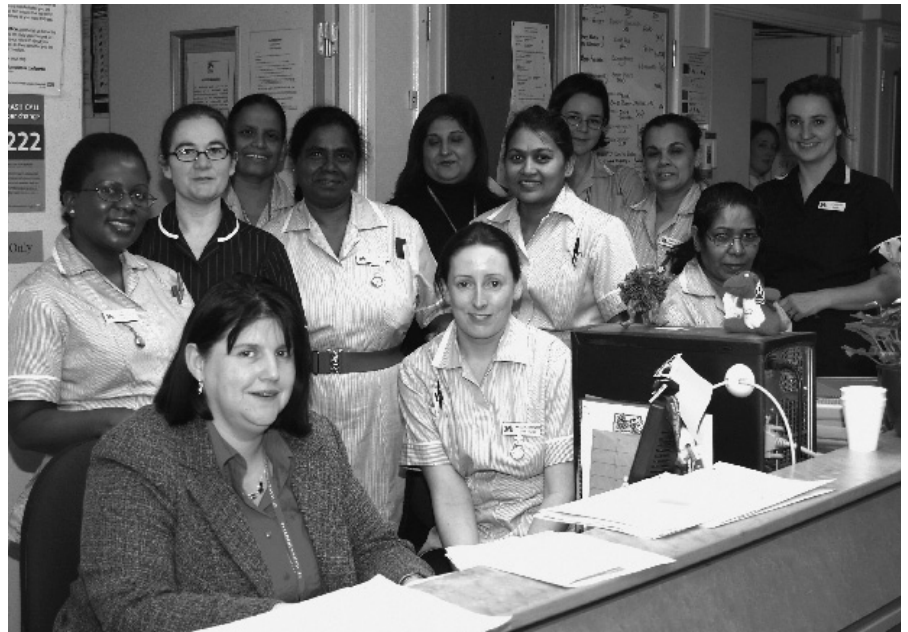
Some of the team on Frederick Salmon Ward.

Firstly I would like to say a big thank you to all of the staff on Frederick Salmon Ward for their dedication and hard work. It has, at times, been a stressful area to work in. As always the ward continues to evolve and patients who attend continue to have the best care possible. Some of the staff have been here for a considerable amount of time and it is with great pleasure that promotions of staff to sister and charge nurse continue.